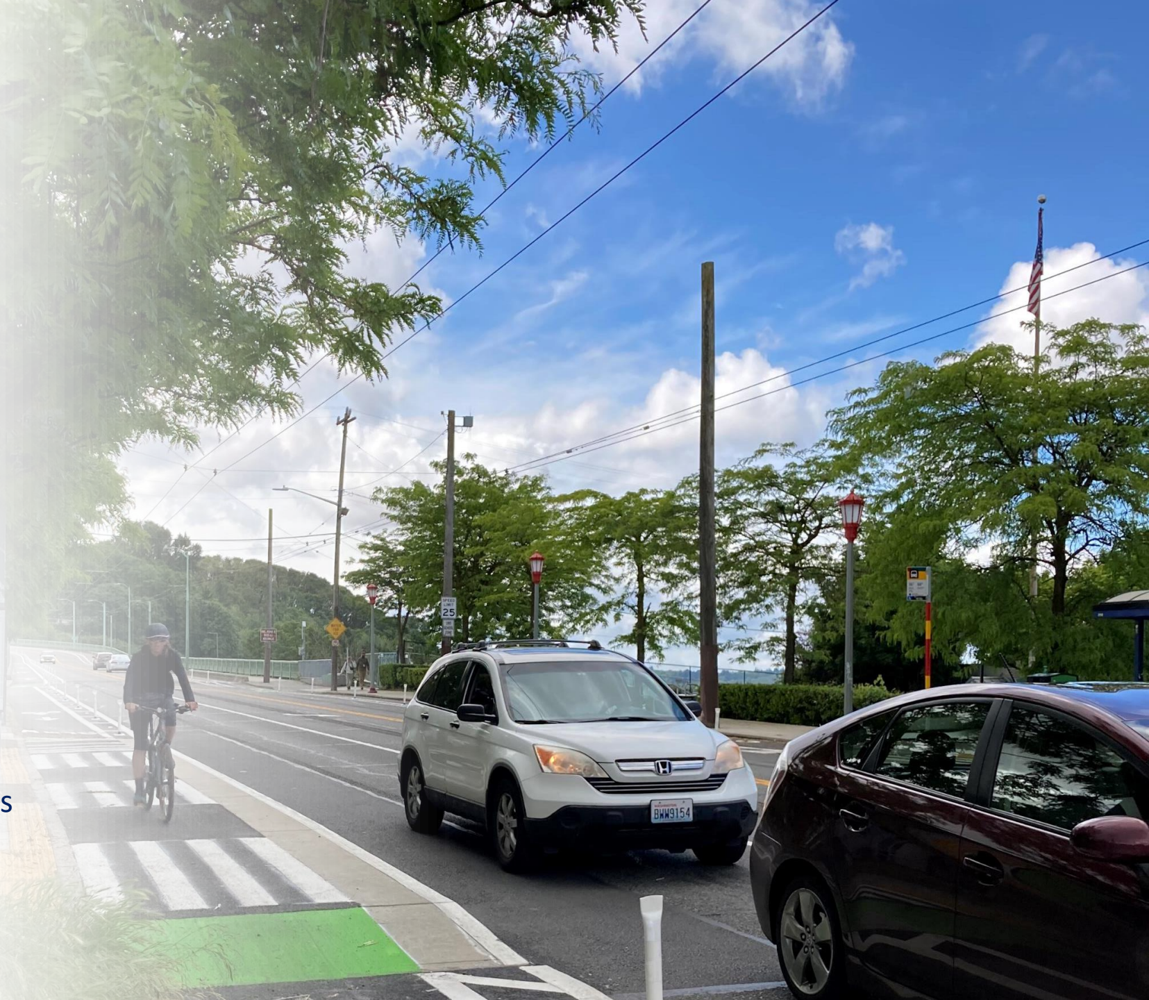
PHOTO: 12 th Ave S protected bike lane.