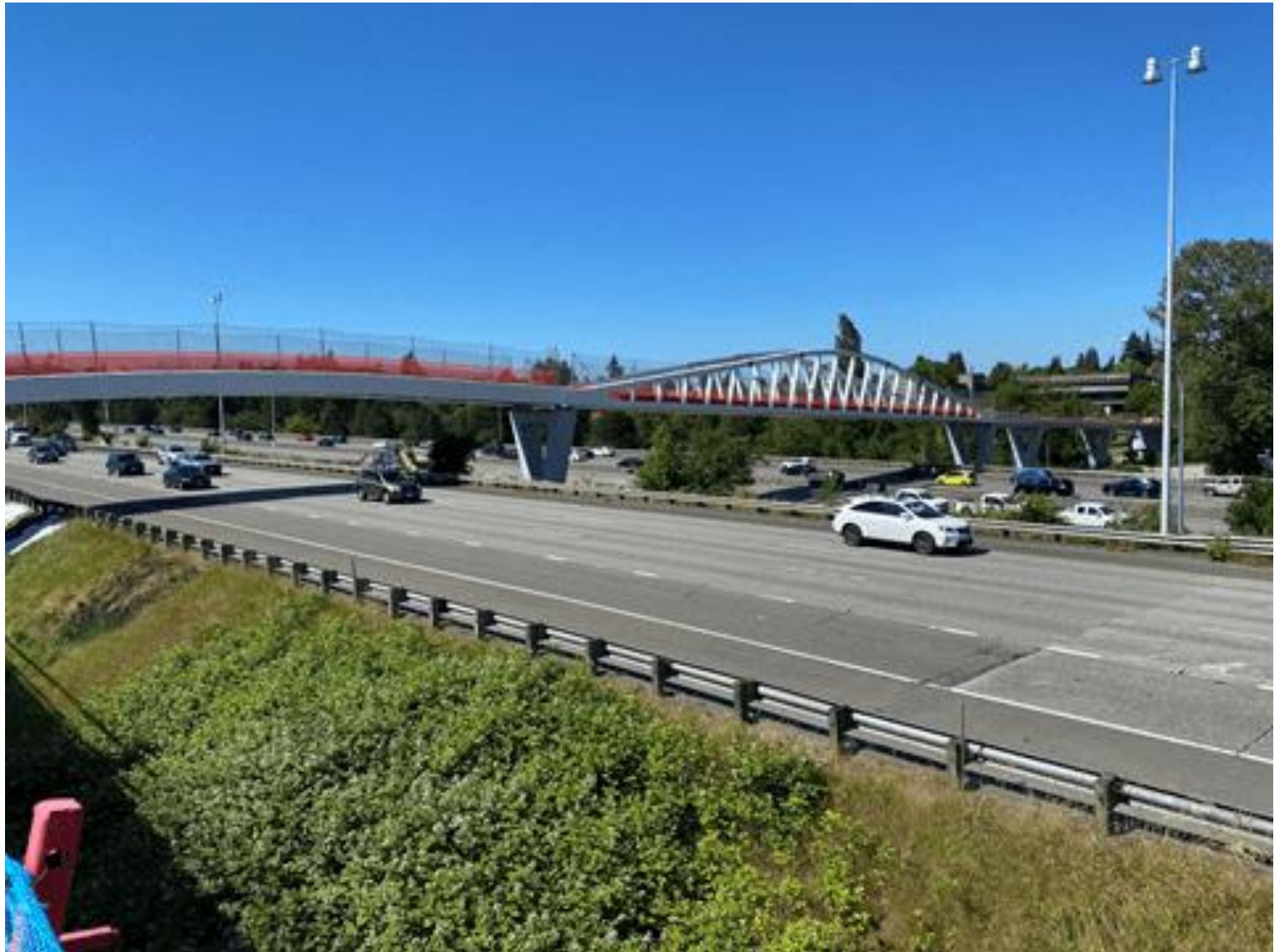
PHOTOS: Northgate Pedestrian and Bicycle Bridge Spans